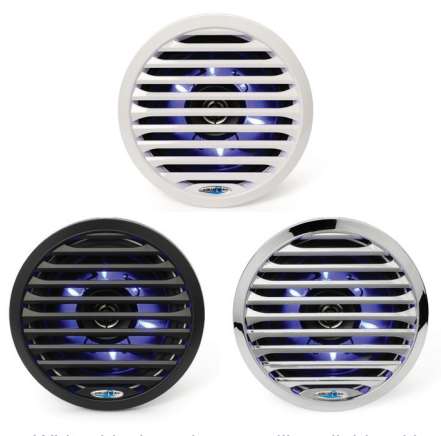
White, black or chrome grill available with blue LED cone illumination